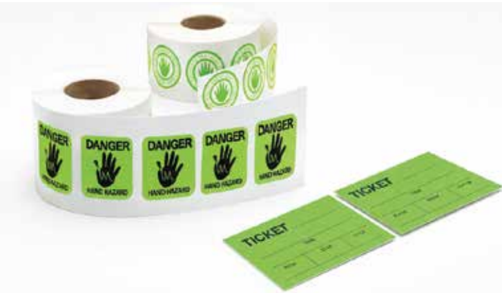
Fluorescent Stickers For Warning Labels And Eye-Catching Branding