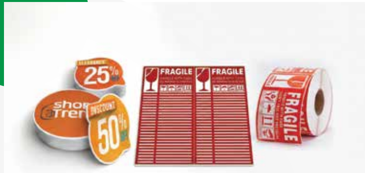
Removable Stickers For Reusable Labels And Temporary Tags