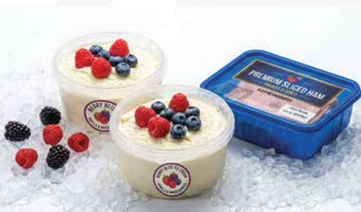
Freezer Stickers For Frozen Food Packaging