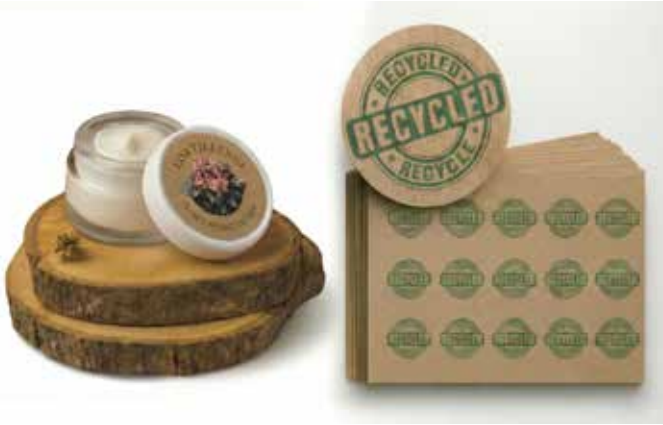
Kraft Stickers For Rustic Packaging And Eco-Friendly Branding