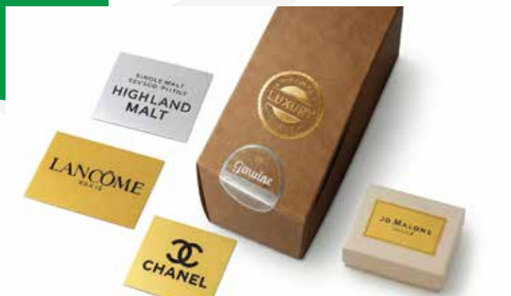
Silver & Gold Pet Stickers For Luxury Branding And Premium Packaging